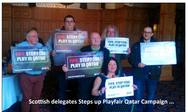
Scottish delegates Steps up Playfair Qatar Campaign ...