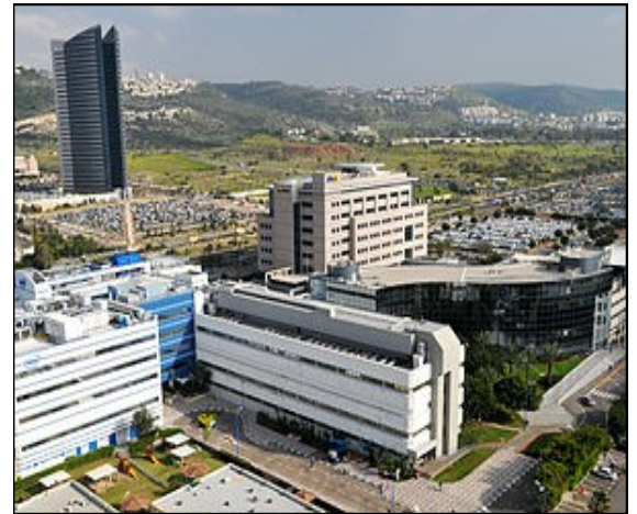
Elbit System headquarters in Haifa .

UNISON has a very clear position on Israel. In line with this position the Scottish International Committee fully supports a continual build-up of awareness about BDS campaign, to ensure that UNISON's policy about Boycott Disinvestment and Sanctions against Israel remains alive and kicking. Scottish International Committee urges upon its publics to take action and visit www.coordin8.org.uk to send a letter to your councillors to demand a public enquiry into this Israeli military-grade technology already deployed in Glasgow City Centre. And build a lobby in all other Scottish Councils to refuse, to install NICE technology in their council area. Organise to End Scottish Arms Trade with Israel (ESATI). For further information see www.scottishpsc.org.uk / www.esati.org