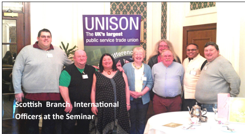
Scottish Branch International Officers at the Seminar

There are two other actions on the ACTSA website for the release of activists, and members were encouraged to take part in these.