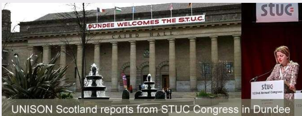
UNISON Scotland reports from STUC Congress in Dundee

The 122nd STUC Congress took place in Dundee on 15-17 April. Reports from UNISON speakers can be found here and for an overview of the whole Congress go to the STUC website .